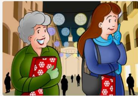
I buy a lot of presents at Christmas .