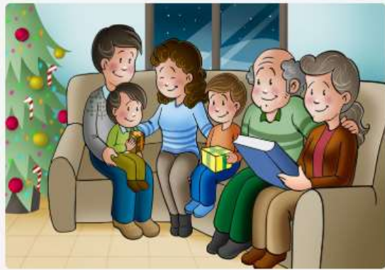
My grandparents visit us on Christmas Day .

En determinadas ocasiones se puede utilizar una preposición u otra, pero tendrán connotaciones distintas: