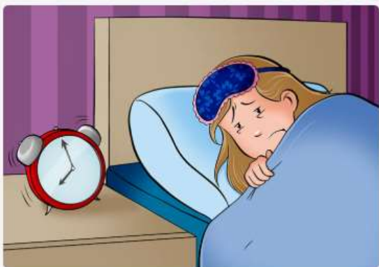
I didn't sleep well in the night . No dormí bien durante la noche.