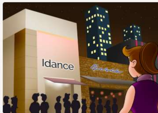
Nightclubs open at night . Las discotecas abren de noche.